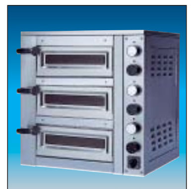
ART. VF3 - 50