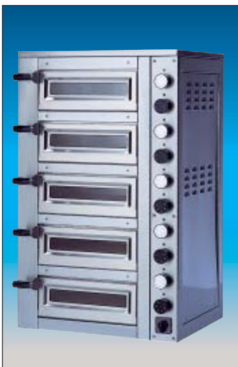
ART. VF5 - 50